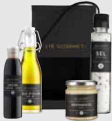
The real Gourmet

LIE GOURMET offers 5 different gift bags, each assigned to a specific theme/person. This simplifies the search for the right gift. The composition of the individual bags is well thought out. A postcard inside the bag gives inspiration and recipes for immediate use of the purchased delicacies. Bon appétit!