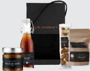
The sweet tooth