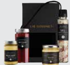
The BBQ chef