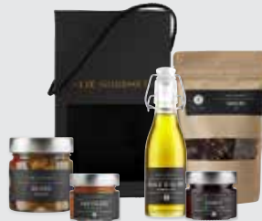
The ultimate snacker