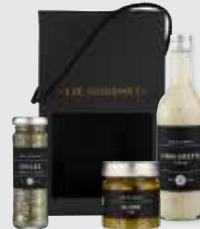
The green foodie